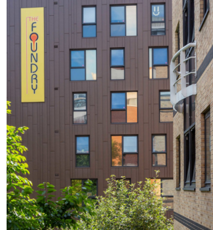
▲ The Foundry, Cavendish St, Leeds LS3 1BN, UK

Transfer prices can include up to 2 people per vehicle - same flight and address